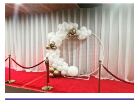
Our AMAZING Foyer Display from The Balloon Ladies